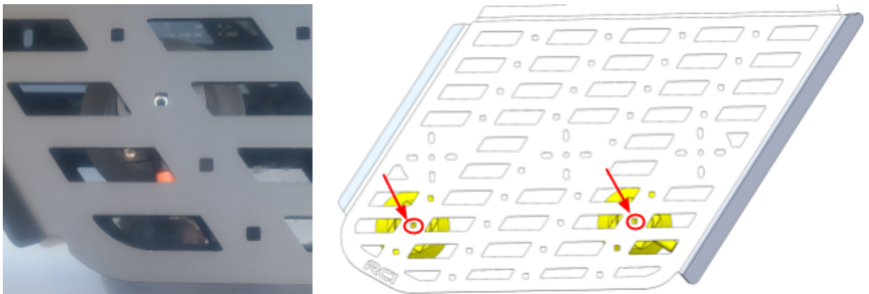
Figure 3: Suction Cup Alignment