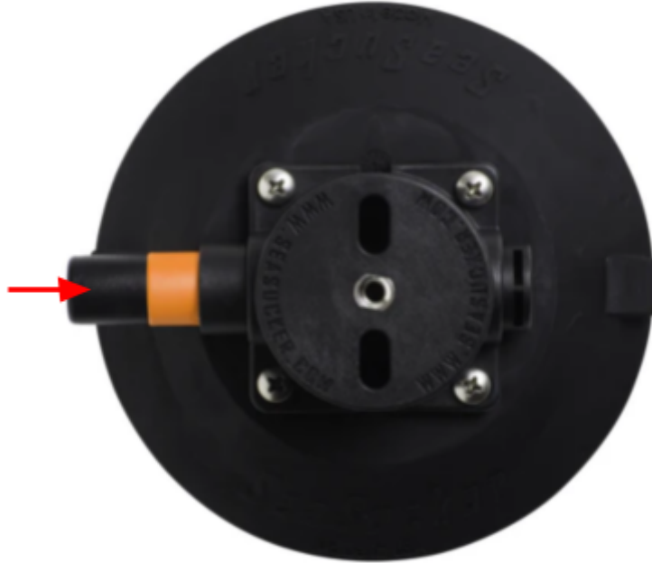
Figure 5: Suction Cup Operation