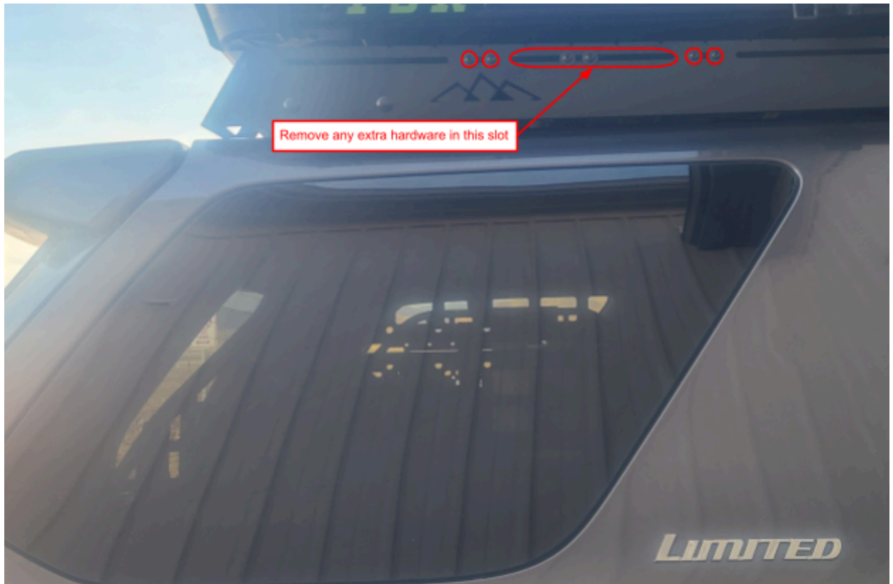
Figure 1: Hardware removal.