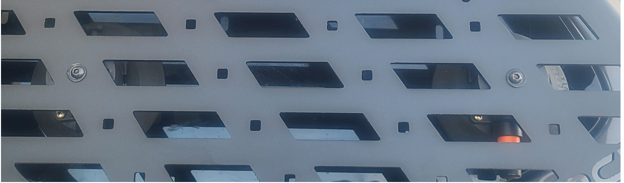
Figure 4: Suction Cup Hardware Installation