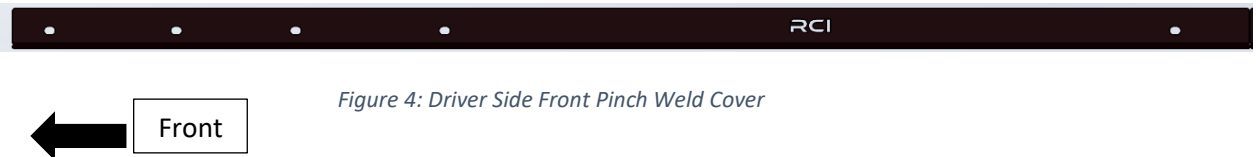
Figure 4: Driver Side Front Pinch Weld Cover