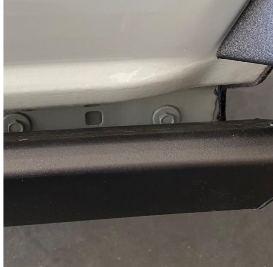
Figure 3: Frontmost pinch weld bolts