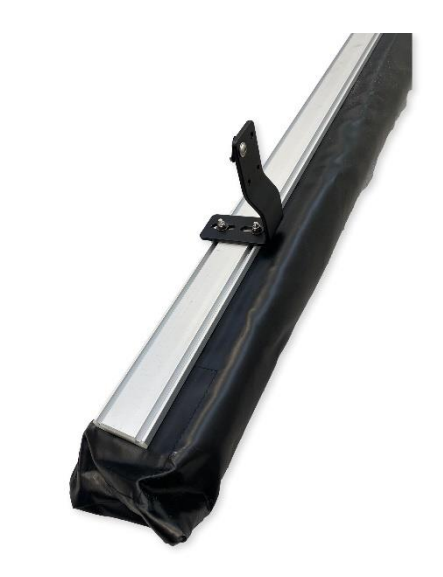
Figure 2: First bracket mounted