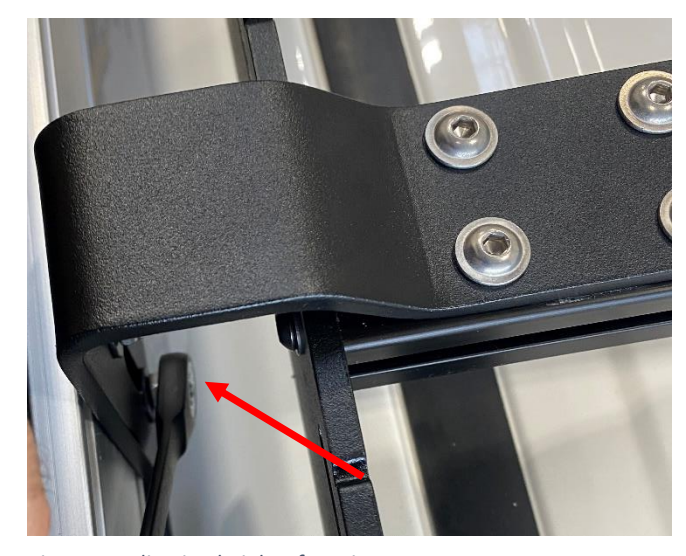
Figure 4: Installing the bracket and awning onto the cross bar