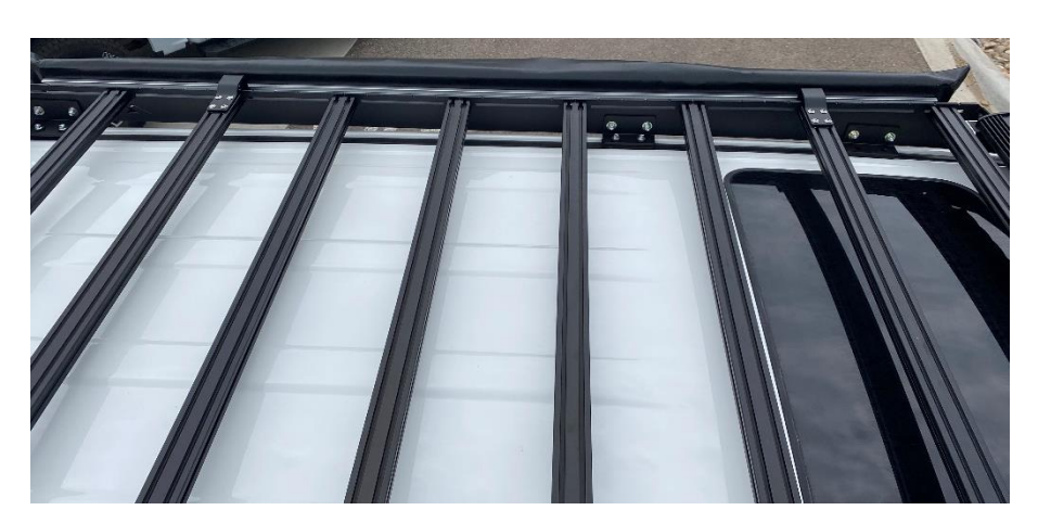
Figure 3: Ideal bracket spacing