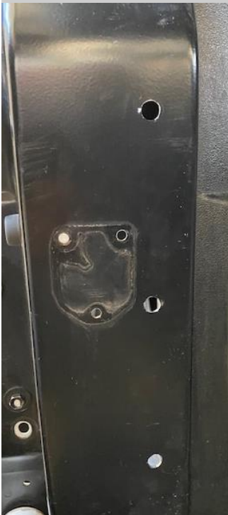
Example of drilled hole locations