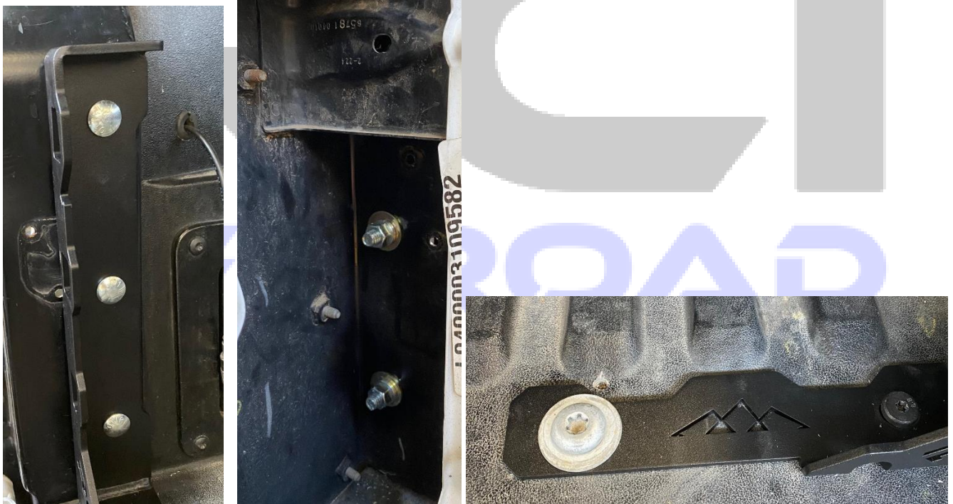
*Example of correctly installed Bed Stiffeners.